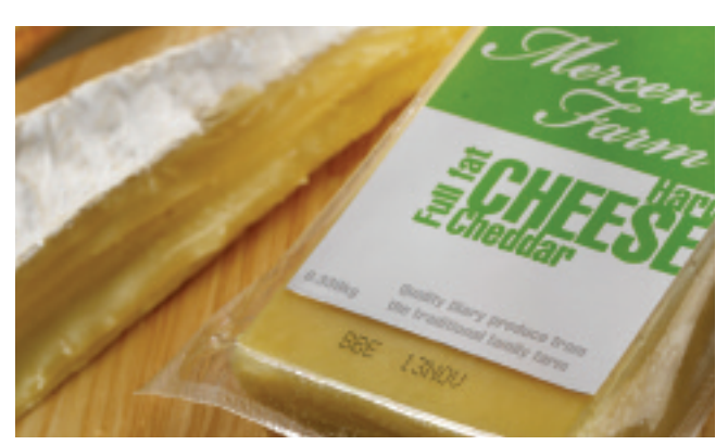
Wide variety of inks to suit modern packaging materials

The A-Series plus offers unrivalled reliability and connectivity, delivering a coding solution that provides increased production efficiencies by addressing the most common and important sources of manufacturing productivity loss.