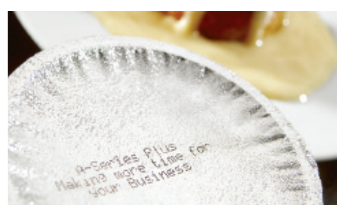
Up to 4 line coding in wash down environments

The Domino A-Series plus range of continuous ink jet printers, deliver proven performance and high reliability ranging from basic coding applications through to those requiring networking capabilities and the highest print quality in the harshest production environments.