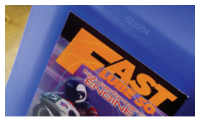
High contrast inks for dark surfaces

• Improved productivity though real-time centrally reported status and message management – without the need for any additional special software.